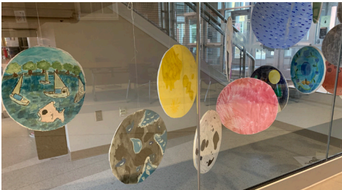
Student artwork on display in the Southwest Commons.

One can't enter Southwest without immediately being presented with the reminder of the school's robust arts scene. From visual art displays in the main staircase, to posters promoting upcoming auditions and performances, the arts are big players! While much attention is regularly garnered to deserving athletic accomplishments, student artists have been busy creating all year long.