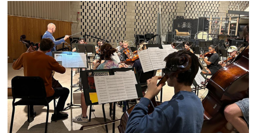
University of Illinois staff Conduct SW students on tour.

performing arts students. Visual arts classes have their end-of-year showcase, the Young Artists Party, on May 25, and on May 31 many will come together to perform at the Somali Cultural Celebration. Visual artists, photographers, poets and creative writers are