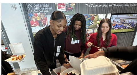
Students enjoyed a luncheon with their TORO mentors.

In the middle of the eight-week program, the students visit the campus of the corporation and meet their eMentors. This year they visited Toro Corporation and were welcomed with red carpet treatment. Students were