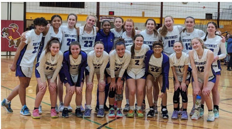
Southwest Girls Basketball after claiming the City Title!

Southwest Athletics had another successful winter season with over 290 students participating on 24 different teams. Our athletes also shined in the classroom as they averaged a 3.73 GPA with many making MN All-Academic Teams.