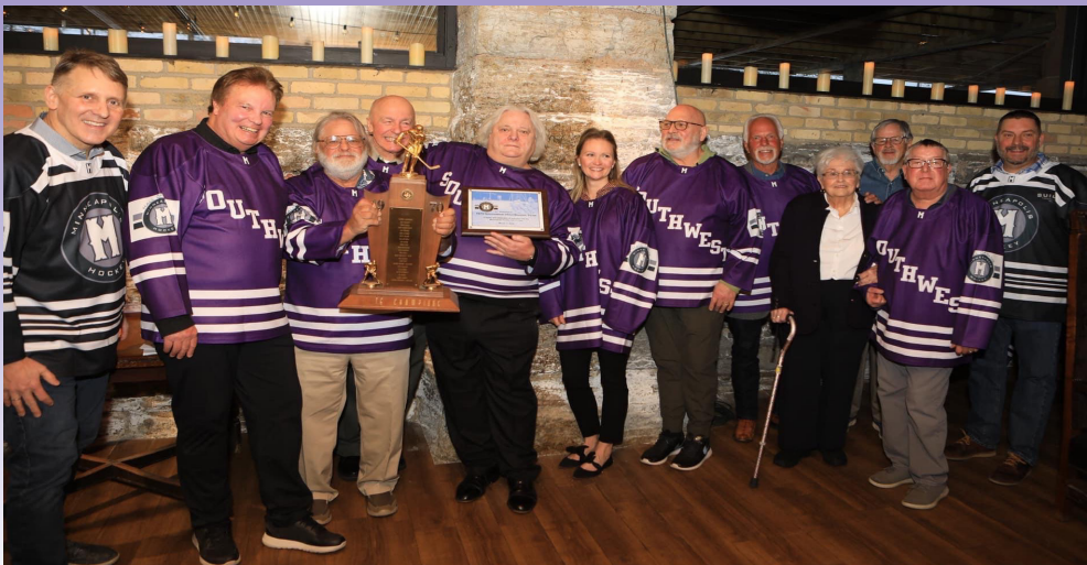
The 1970 Hockey State Champion Team was inducted into the Minneapolis Hockey Hall of Fame on Mar 11.

On March 7, 1970, the ultimate high school hockey border battle took place when Minneapolis Southwest and archrival Edina met for the Minnesota state championship. Edina was the undefeated defending state champions.