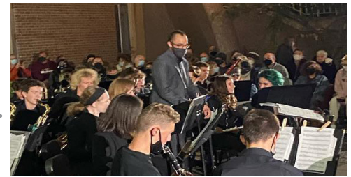
The band performs new music at the fall concert on Oct 14 in the SW courtyard.

to balancing the library and that is what I am committed to doing,” he adds. The $450.00 Grant received unanimous Board support and was fully funded. The budget for any new music purchased comes from donations and concert ticket sales. With no concerts last school year, there was no budget for