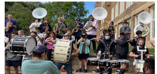
The pep band performs at First Friday.

From the band blaring the school song to kick-off the event, the free BBQ lunch, and the enormous diverse representation of the school on full display, it was a day like none other. Plans for next year are already underway to make this tradition bigger and better.