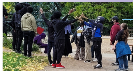
AVID students at Lake Harriet for AVID Day.

After 18 months in distance learning Southwest AVID (Advancement Through Individual Determination) was able to hold the annual AVID Day at Lake Harriet. Working with Project Success, AVID students and teachers from grades 9-12 gather for a day of community building and inspiration. One element of AVID Day is the opportunity for seniors to plan and lead the younger stu-