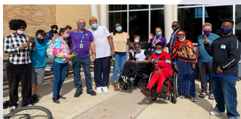
Special Education students and staff enjoy First Friday on Sept 17, 2021.

The day also served as an overdue in-person celebration. “The entire school community coming together was extremely powerful and the fun had was both needed and therapeutic for both students and staff,” said planning