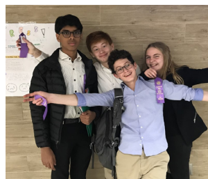
Freshman Debate Team members celebrate their first place ribbons at Regionals.

Despite repeated pleas to Minneapolis Public Schools (MPS) officials, Southwest is at the bottom of per student funding. Most high schools have student programs, adequate counseling resources and college-preparatory activities paid for through the MPS budget. The