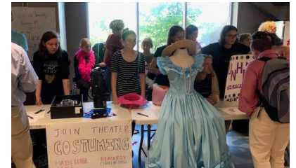
Theatre students recruit at First Friday.

"We are doing something right at Southwest, but sustaining it is a challenge."